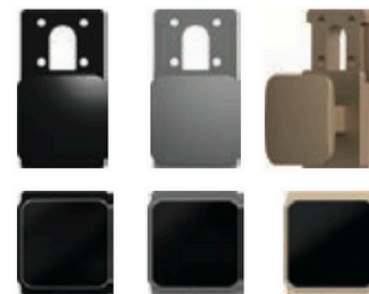
Concealed Square Hand